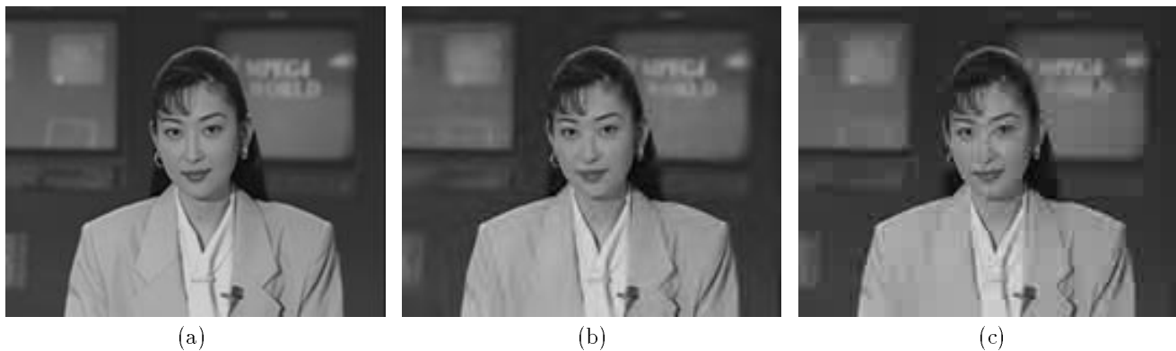
Figure 3: Intraframe coding results of the first frame of the “Akiyo” sequence at 14 kb. (a) The original frame, reconstructed frame by (b) VSLCCA, PSNR = 35.34 dB, and (c) H.263, PSNR = 33.06 dB.